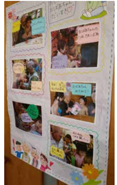
Snapshots of children engaging with the elderly in Kotoen

Typically, daily interaction sessions between children and elderly are organised (though there was no intergenerational activity during the visit as an influenza infection had broken out among the children). The team was told that children are allowed to play and exercise bare bodied to strengthen their immunity. They even saw one volunteer teaching the children sumo wrestling!