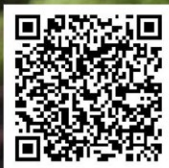
(Blue/Gray)

Get info/Register: Scan the QR code or visit www.sjsm.org.sg/courses . Questions? Email ce@sjsm.org.sg .