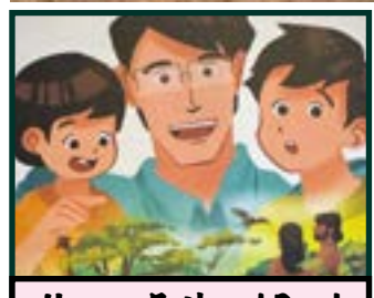
Happy Fathers' Day!