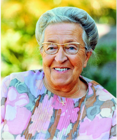
Corrie ten Boom 1892-1983

“When Jesus rode into Jerusalem on Palm Sunday on the back of a donkey, and everyone was waving palm branches and throwing garments on the road, and singing praises, do you think that for one moment it ever entered the head of the donkey that any of that was for him?”