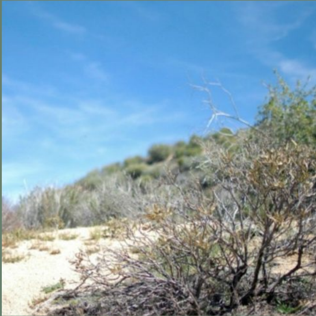
Desert Bush in the Wasteland