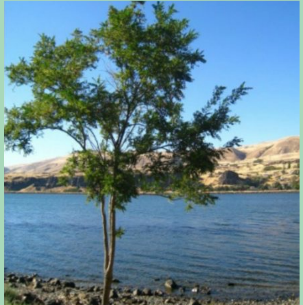
Fruitful Tree by the Water