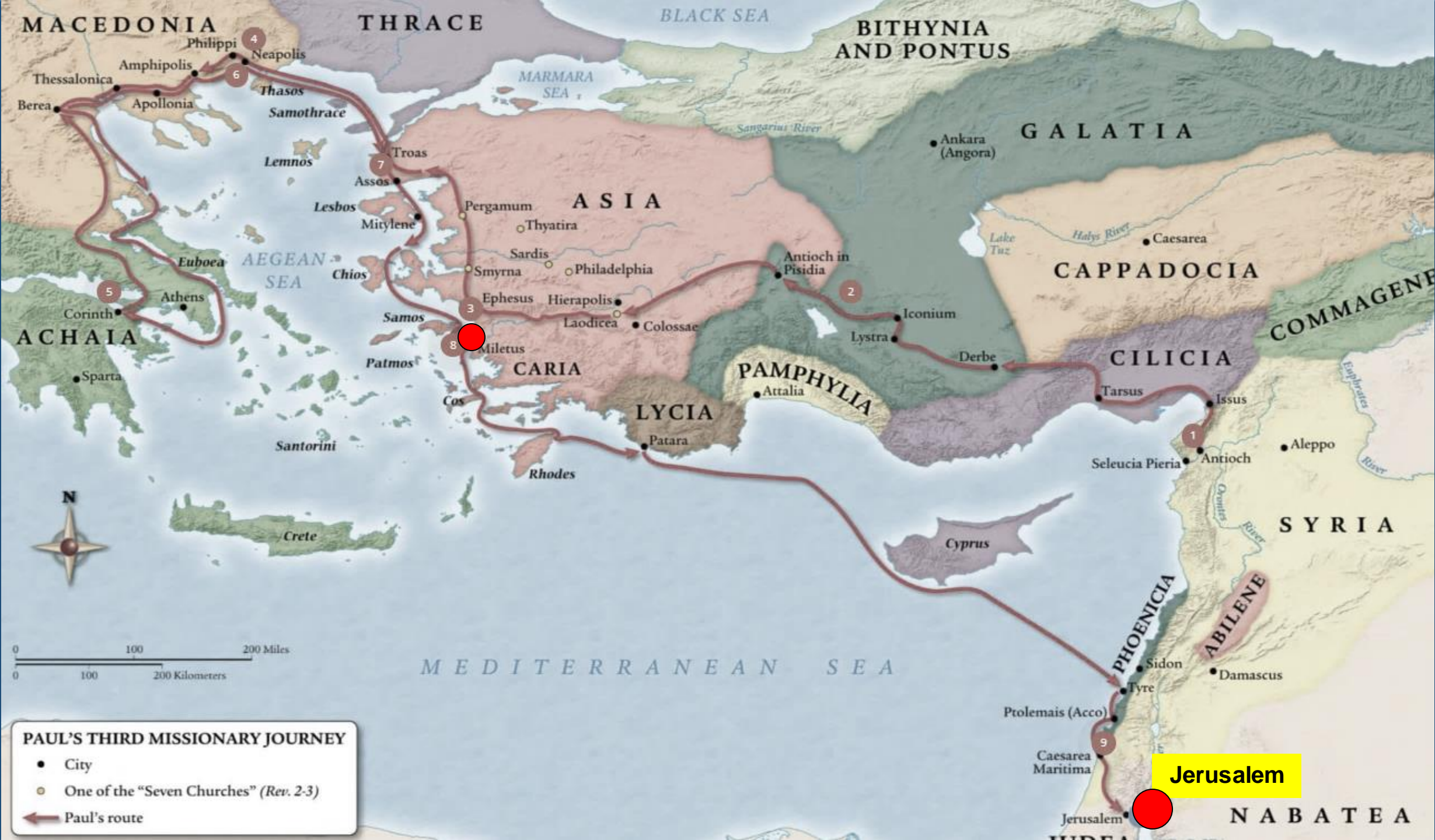
PAUL'S THIRD MISSIONARY JOURNEY ● City ○ One of the "Seven Churches" ( Rev. 2-3 ) ← Paul's route